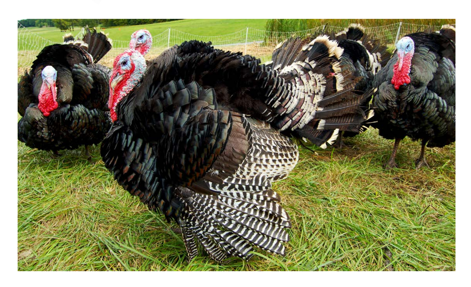
Poultry available in Fresh, Frozen, Bulk, IQF, and Tray Pack. Ask Sales Account Manager for details.